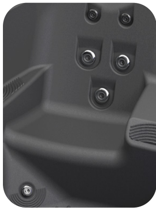
Ergonomic seats with specialized massage for maximum comfort

The Monsoon allows you to lie down in two different positions, letting you stretch out according to your specific needs.