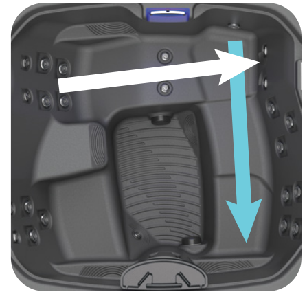
Double lounge with multi-level bottom

The Monsoon has several sensorial zones for a specific massage of the feet, heels, palms, wrists, etc.