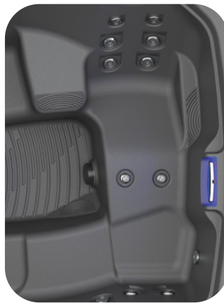
Built-in handles for easy entry and exit