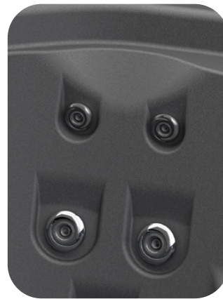
Ergonomic bed with back, leg and foot massage