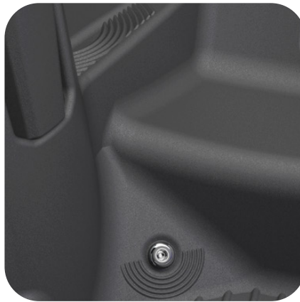
Sensation massage for hands and feet

A specially designed slot will hold your phone or tablet and drinks so you can watch your favorite TV show or sports event.