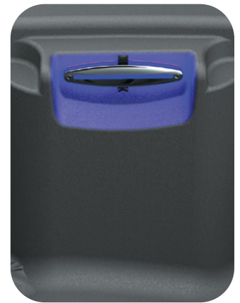
Waterfall with new exclusive design for Monsoon